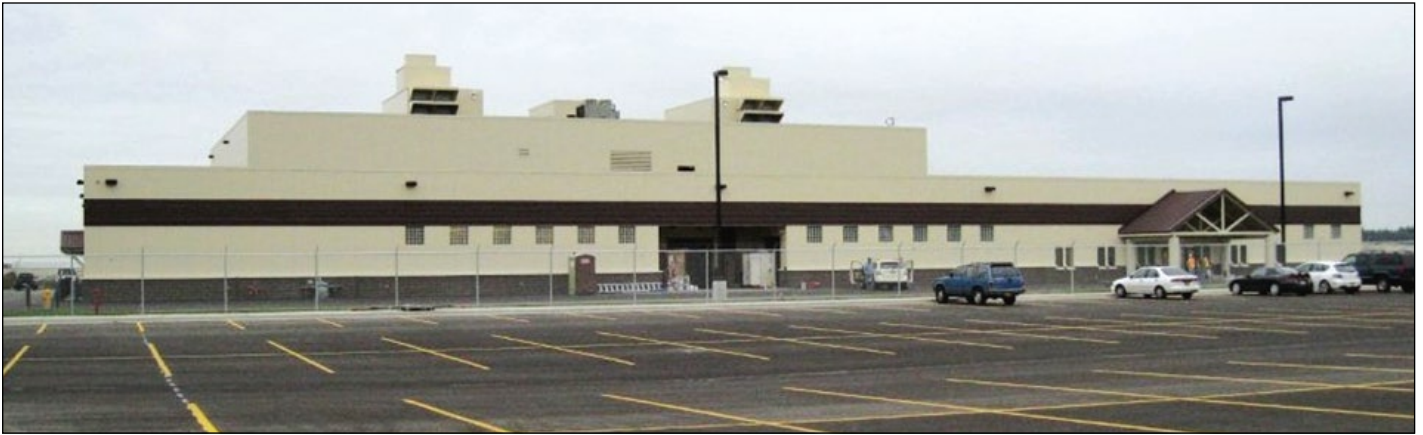
The F22 LO Maintenance Facility design-build project at Joint Base Elmendorf-Richardson was the first facility built to support the F-22 Wing.