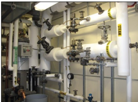
Aaron Plumbing and Heating Company completed several renovations for the dormitory remodel project and Eielson Air Force Base including piping in the mechanical room.