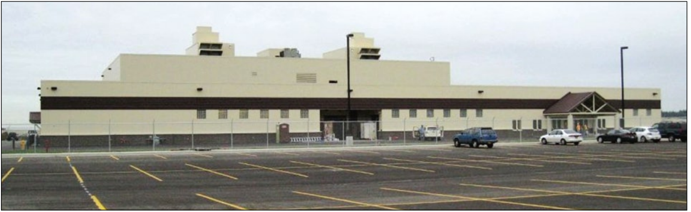
The F22 LO Maintenance Facility design-build project at Joint Base Elmendorf-Richardson was the first facility built to support the F-22 Wing.